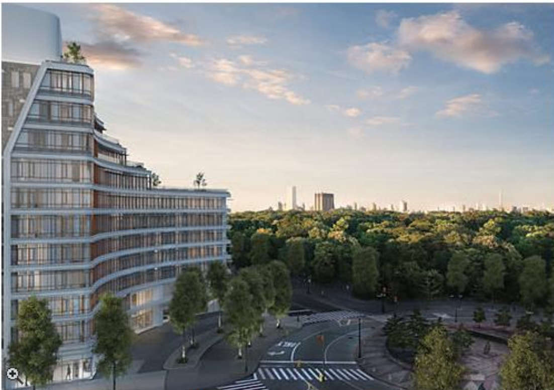
Rendering by The Seventh Art via NYT

Artimus purchased the site of the building, located at 285 West 110th Street back in 2014 for $25.5 million .